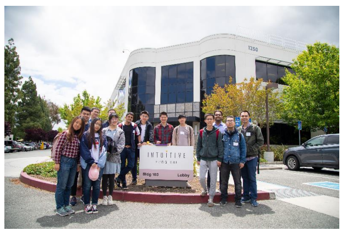
Company Visit in Silicon Valley, USA May 2019